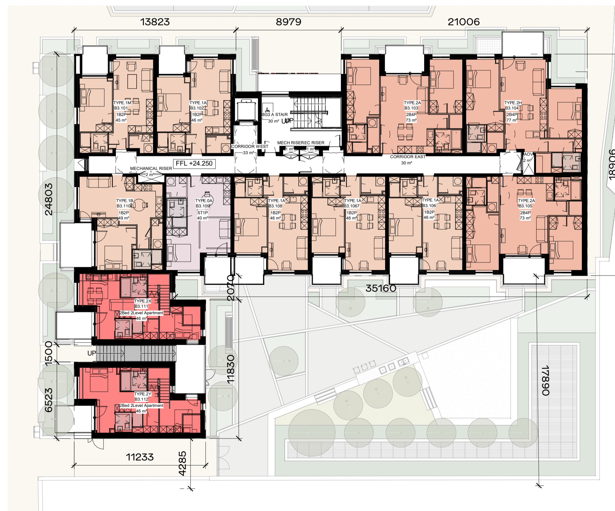
2 1200_BG3_BLOCKPLAN_L01_FFL 1:200