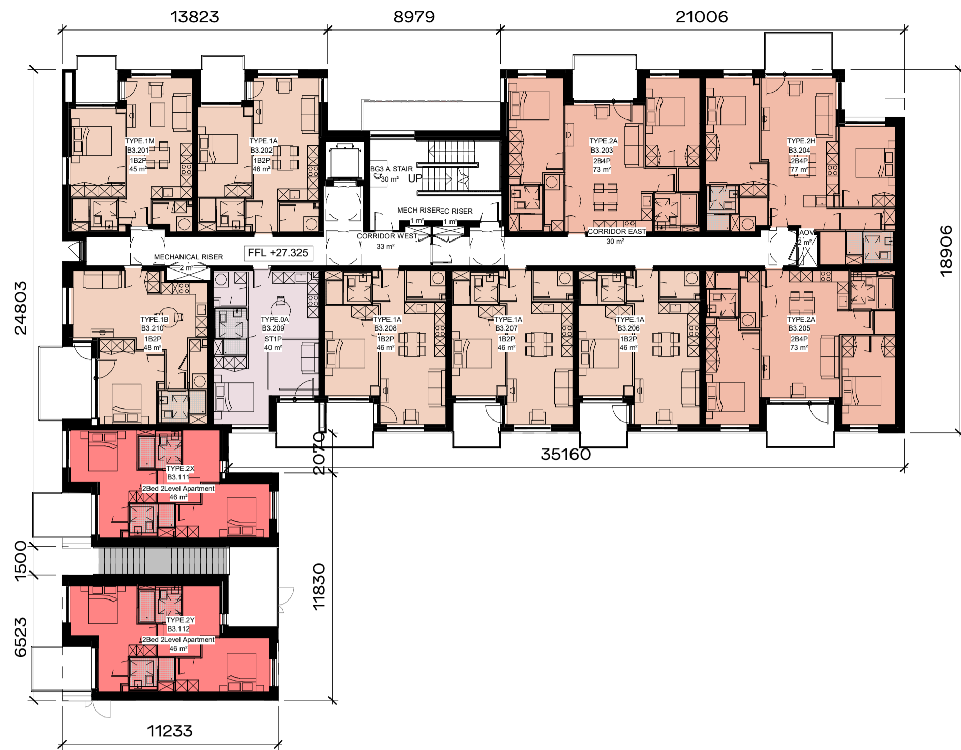
3 1200_BG3_BLOCKPLAN_L02_FFL 1:200

ALL DIMENSIONS TO BE CHECKED ON SITE NO DIMENSIONS TO BE SCALED FROM THIS DRAWING DRAWING IS TO BE READ IN CONJUNCTION WITH RELEVANT CONSULTANTS DRAWINGS