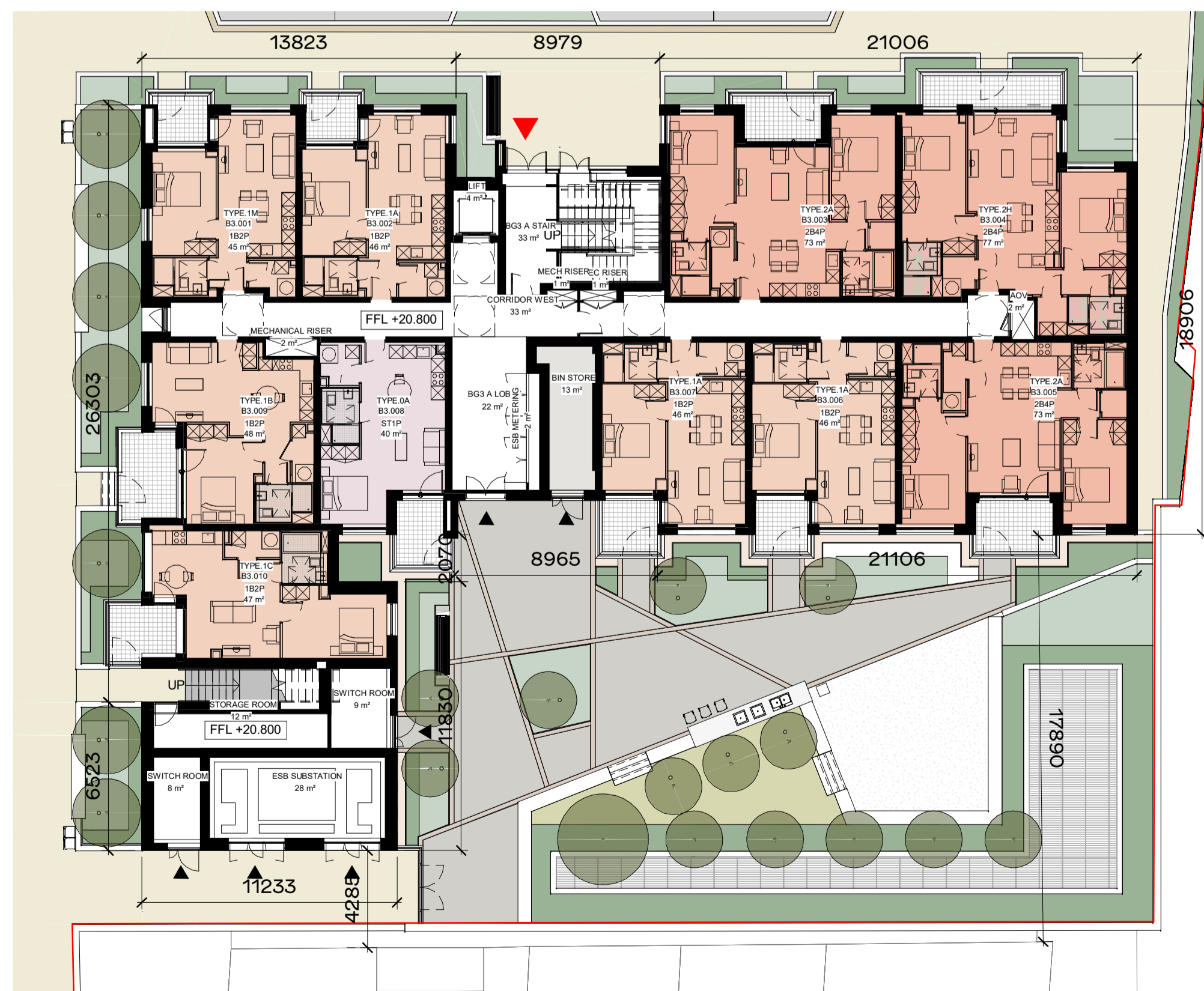
1 1200_BG3_BLOCKPLAN_L00_FFL 1:200